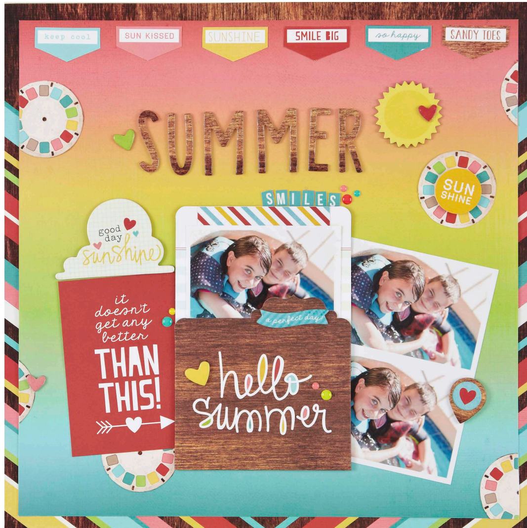
designed by: Rebecca Keppel

Simple Tip: Insert a photo in a SN@P! Pocket to add emphasis to a specific photo