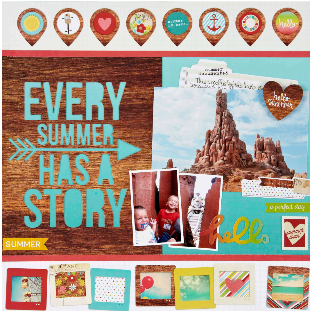
designed by: Wendy Antenucci

Simple Tip: Tuck your journaling under a photo using a Bits & Pieces die cut