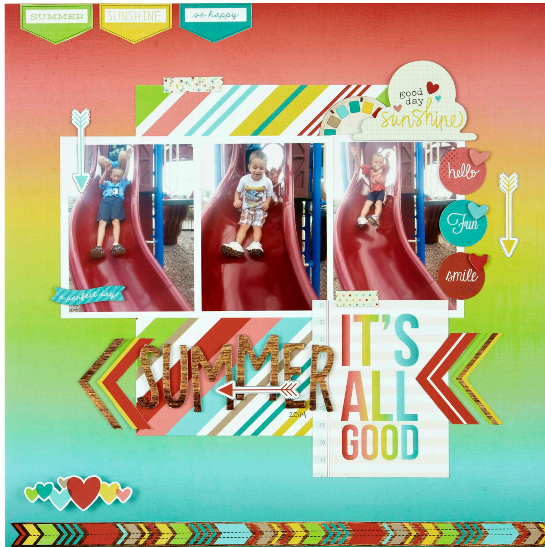
designed by: Wendy Antenucci

Simple Tip: Combine 3 like-sized embellishments to create a border that pops, like Wendy did here with the Bits & Pieces circles