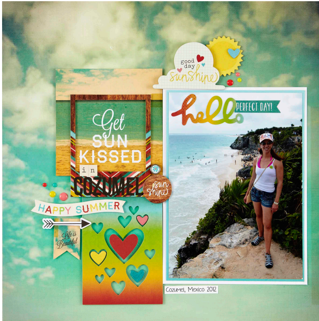
designed by: Guiseppa Gubler